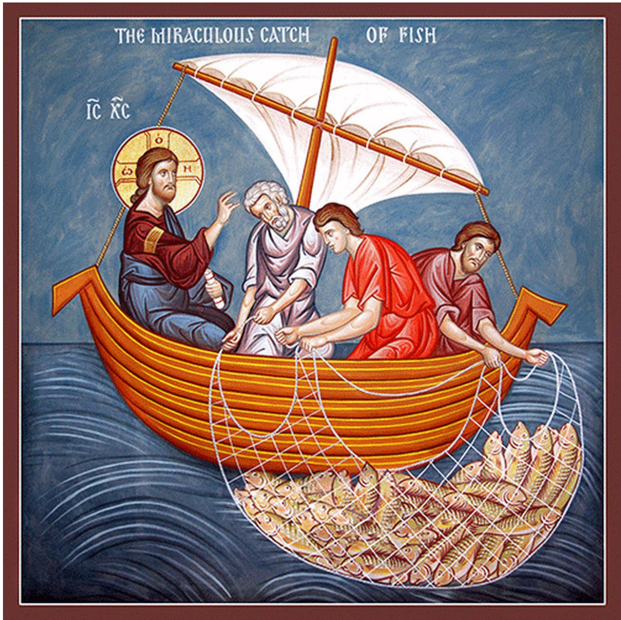
The Miraculous Catch of Fish St. Herman Orthodox Christian Church in Fairbanks, Alaska