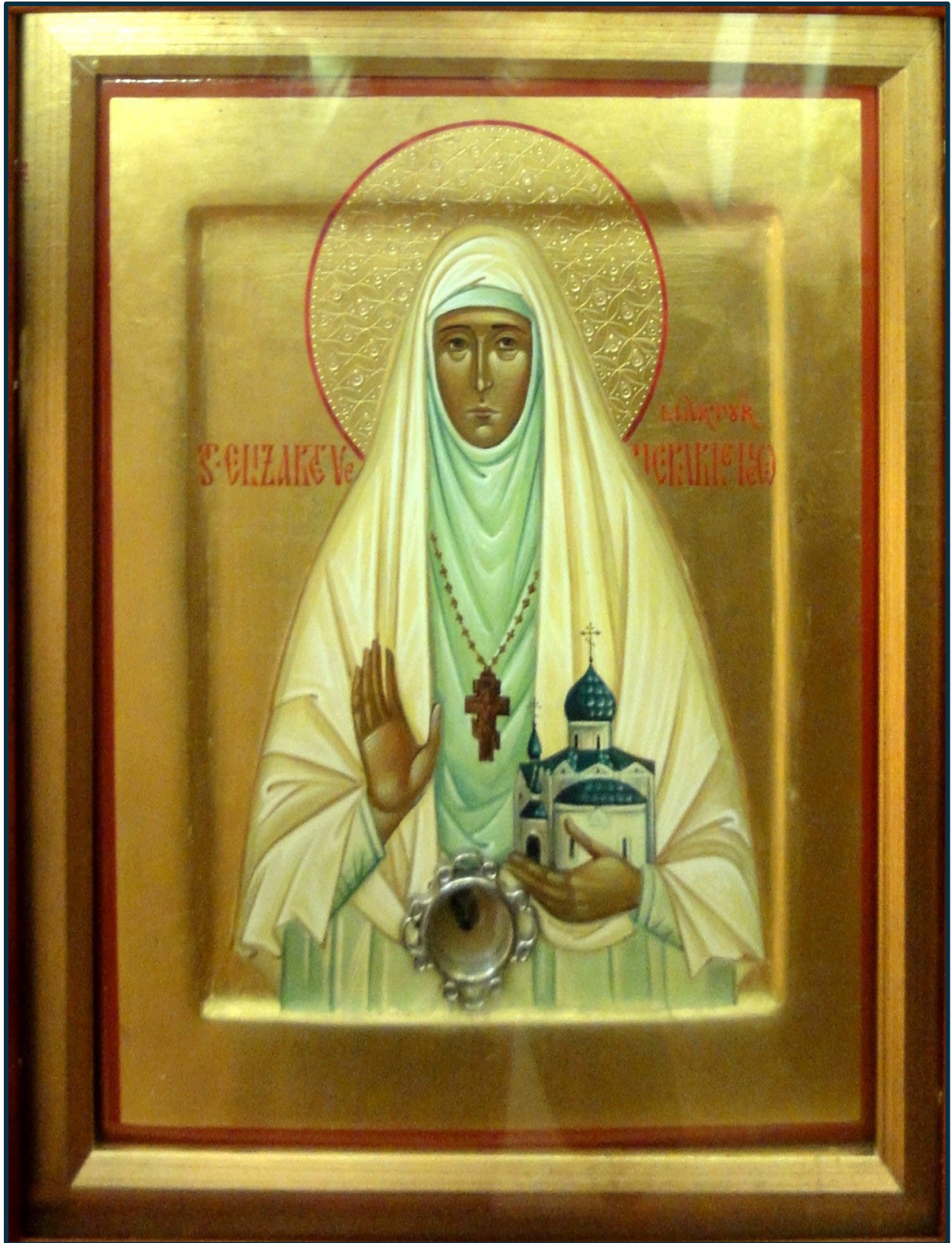
St. Elizabeth the New Martyr Holy Trinity Cathedral in San Francisco, California