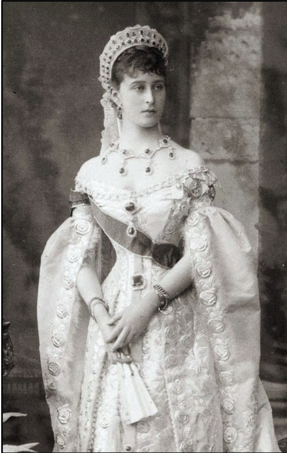
Grand Duchess Elizaveta (Elizabeth) Feodorovna Charles Bergamasco, 1885