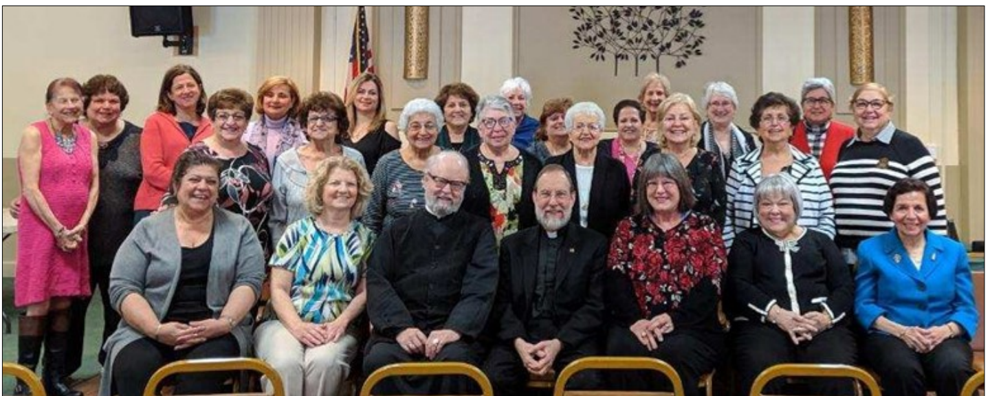
The Antiochian Women of DOWNE at one of the Diocesan Meetings where they plan and implement ways to “serve Christ through serving others”.

The Antiochian Women of DOWNE are a delightful group of women fulfilling the goals set forth in our mission statement. It is a pleasure serving as their president.