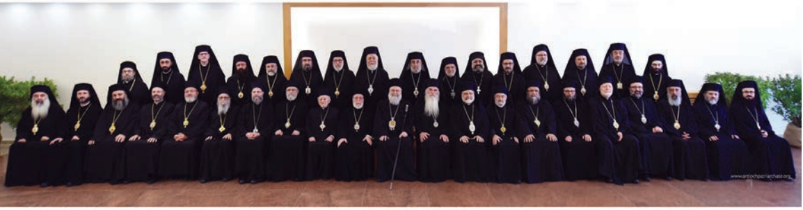
دورة المجمع الأنطاكي المقدس تشرين الأول ٢٠١٩ - البلمند