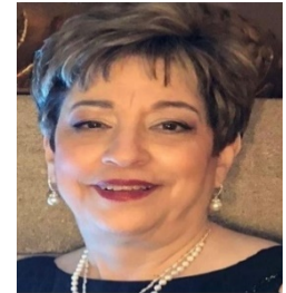
Deborah Brown Children's Relief Fund