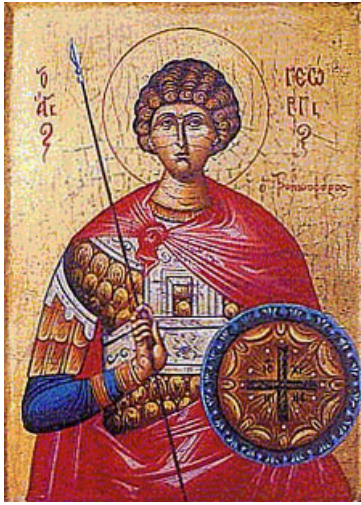
by St. Paisios the Athonite

â€”Geronta, a certain young man who has chosen the married life asked me how one properly begins this?