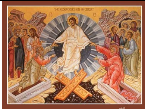
Icon of the Resurrection