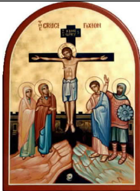
Icon of the Crucifixion Great and Holy Friday