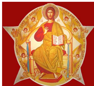
Icon of the Pantocrator (Judge of All) From the Ascension icon Placed in the dome of the Church