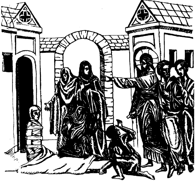
Icon courtesy of Iconographics (www.theologic.com)