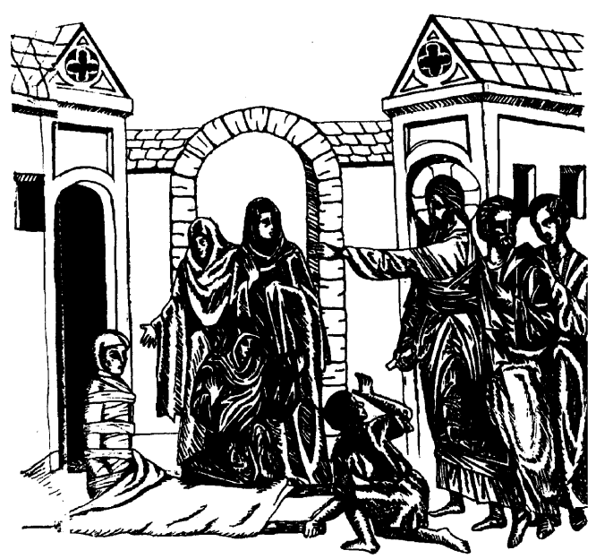
Icon courtesy of Iconographics (www.theologic.com)